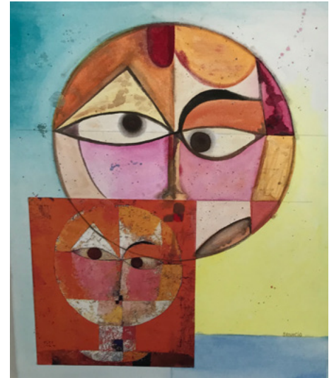
Artwork from the “Konschtatelier” art workshop in Luxembourg

At the initiative of the German Alzheimer association (Deutsche Alzheimer Gesellschaft), several associations came together to support