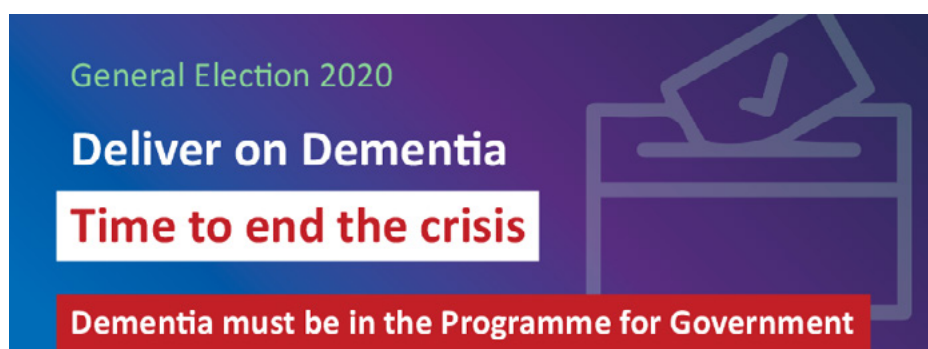
Voter prompt card

Fine Gael and Fianna Fáil have been working on a joint policy document, with the two parties having 72 seats combined – eight short of a majority. At the time of writing, Taoiseach (Prime Minister) Leo Varadkar has said that the two traditional parties need a ‘third party’ as well as Independents to form a stable Government, explicitly mentioning Labour,