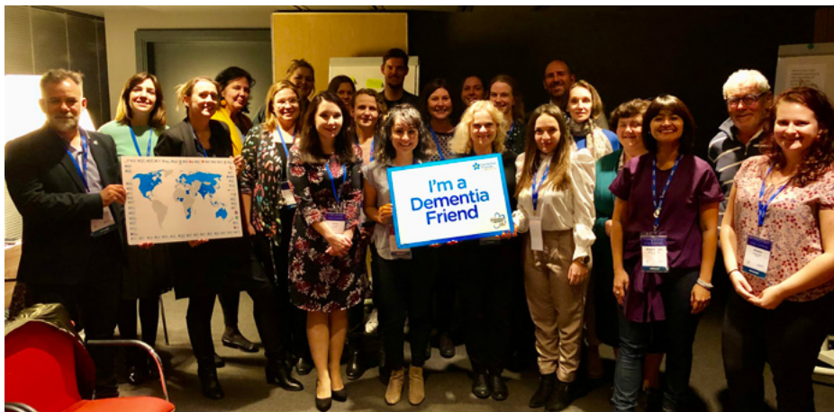
Global Dementia Friends Network meeting

learning across the world and learning from others". As this project comes to an end it cannot be transferred to another partner in its current shape and purpose. Alzheimer's Society is working with Alzheimer's Disease International (ADI), to help manage the communication around the cessation of the programme and to provide advice for the network in terms of how it can stay connected.