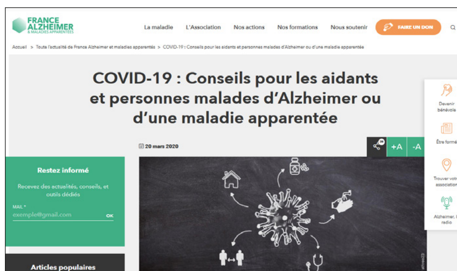
France Alzheimer published COVID-19-related resources on its website

There have, however, been some positive sides as well. As soon as all activities were cancelled, local professionals started thinking