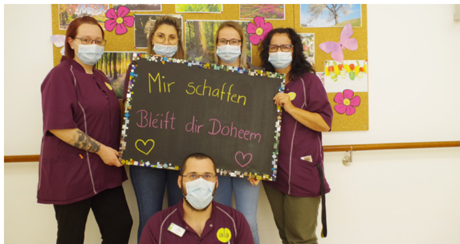
“We are working, so you can stay at home”

To support people with dementia who are isolated at home, France Alzheimer suggests creating a structured routine that can be