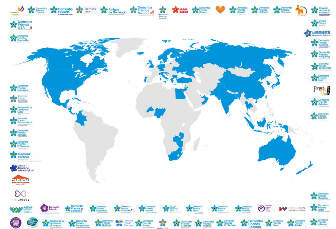
Global Dementia Friends Network map, March 2020

For more information visit: www.dementia-friends.org.uk