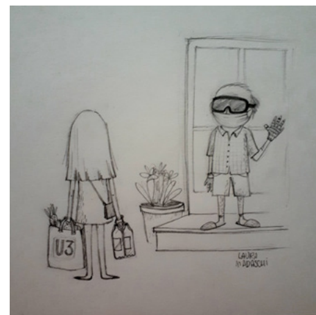
“Mask and gloves”

possible to activate a home delivery service for all the families in the neighborhood. The last concrete example from southern Italy is from Villaricca, on the outskirts of Naples, where a booklet called “Caterina’s advice” was launched. This booklet contained solid advice and good suggestions regarding the correct use of the PPE and how to reduce and manage stress related to confinement.