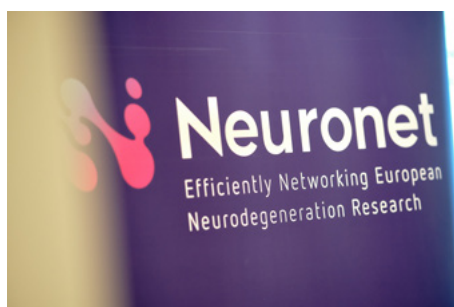
Alzheimer Europe co-hosted the lunch debate with the Neuronet Coordination and Support Action