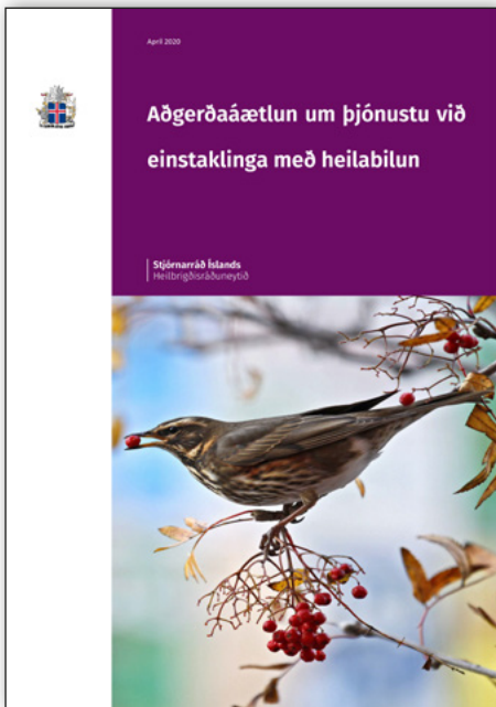
Icelandic Dementia Strategy