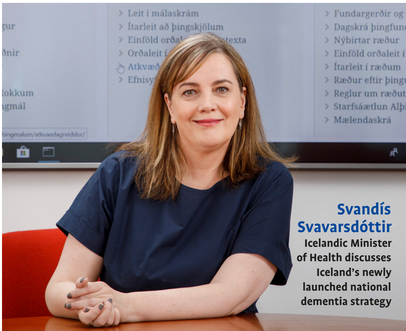
Svandís Svavarsdóttir Icelandic Minister of Health discusses Iceland's newly launched national dementia strategy