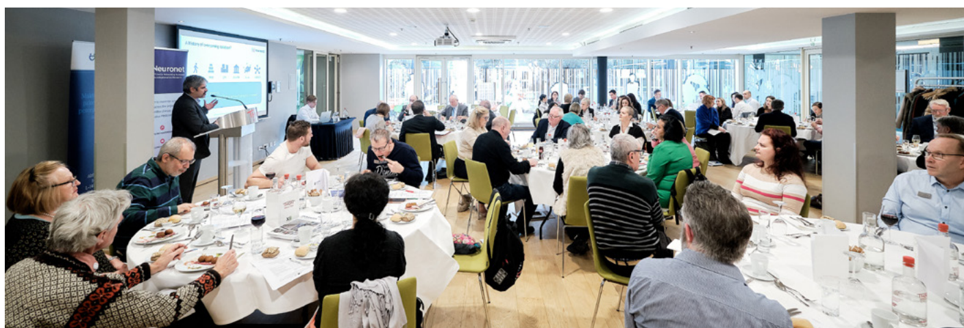
A total of 70 people attended the lunch debate