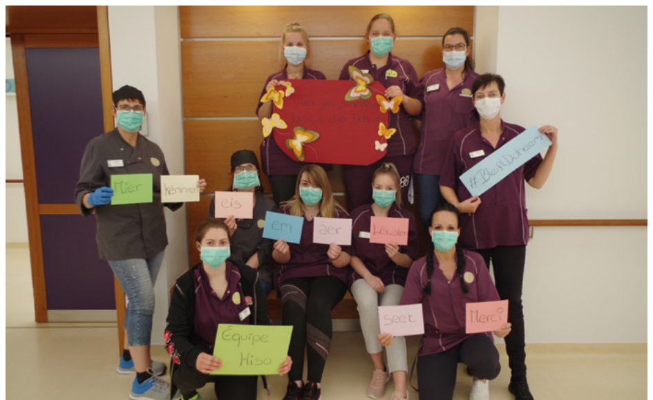
Association Luxembourg Alzheimer employees hard at work during the pandemic

carers of people with dementia, by publishing guidelines and information for carers around the topic of care at home, during confinement. They particularly emphasised the importance of planning and of daily routine and gave suggestions as to how to do this and what might be important to include in a daily schedule. ALA compiled these various guidelines, in both German and French, on its website www.alzheimer.lu . For any questions carers might still have, the ALA helpline is still available 24/7. The number is: 26 432 432 (national calls only).