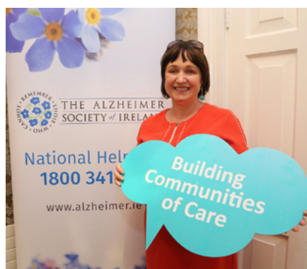
Senator Fiona O'Loughlin sets out her priorities following her election to the Seanad Éireann