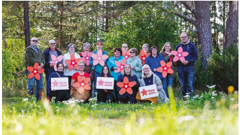
Muistikummit – Dementia Friends in Finland

The Finnish Dementia Friends programme, “Muistikummit”, was launched by Muistiliitto, the Alzheimer Society of Finland, in September 2018. There was even a session of Muistikummit in the Finnish Parliament on World Alzheimer’s Day, 21 September 2018.