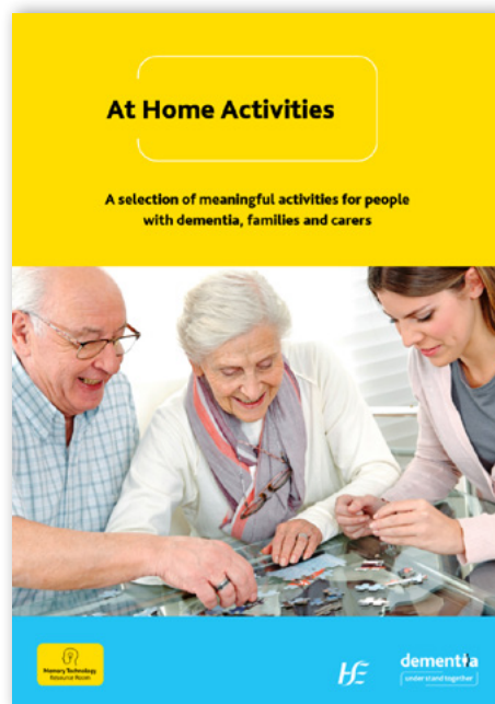
The ASI and HSE jointly published a resource on home-based activities

Alzheimer associations across Europe are working tirelessly, during this pandemic, to support people with dementia and carers, at the local and national levels. You can read a selection of articles about what they have been doing, here: www.alzheimer-europe.org/News/COVID-19-situation