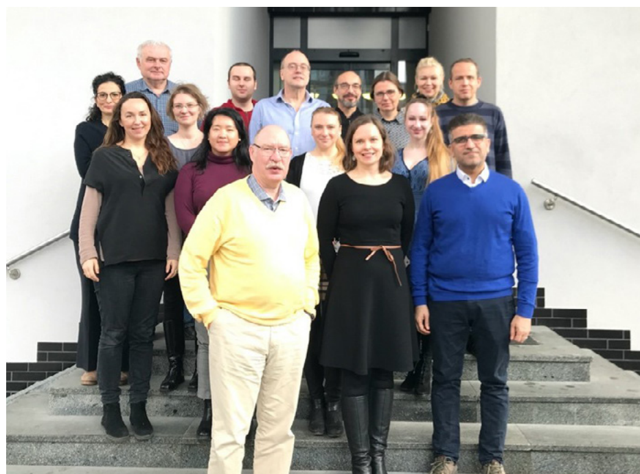
ADAIR consortium at kick-off meeting in Prague, Czech Republic, 16 January 2020

One of the main challenges in this research is deciphering which exact type of air pollution exposure is harmful for brain health. The duration and level of exposure are likely to be critical in determining the consequences on health. In addition, deciphering how genetically determined predisposing factors may play a role in the risk of health impairment is another complex challenge that requires intensive investigation.