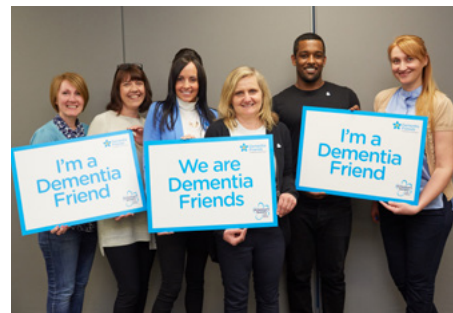
Dementia Friends England and Wales

Dementia Friends are also surveyed on a regular basis. It has been identified that 86% of Dementia Friends in England and Wales have an improved understanding of dementia and 84% feel the programme is inspiring communities to take action. Personal stories of impact also demonstrate the success of the programme and are celebrated at the annual Dementia Friendly Awards.