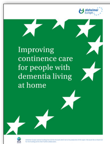
Continence Care Report

Following on from this work, Alzheimer Europe has contributed towards the development of key performance indicators (KPIs) to measure outcomes for the daily management of toileting and containment within a range of care settings. It is hoped that these KPIs will contribute towards improving the quality of continence care for people with dementia. Another, important area of work has been the development of policy recommendations, as mentioned above, and Alzheimer Europe is currently a member of an advisory board for a study to