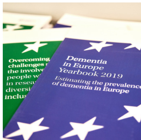
Alzheimer Europe launched two reports at the lunch debate

health systems are not currently sustainable and discussion around prevention must be part of the discussion around dementia.