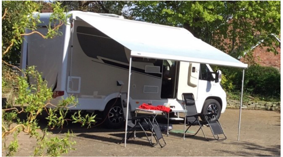
The new campervan

Within 15 minutes of the announcement, our daughter left home. She is a key worker looking after young children and she was not prepared to risk bringing the infection into our house, and so moved out. That was a very surreal moment, and I insisted on hugging her tight as I didn't know when I would next be able to do so. Our son's wedding on 13 April had to be postponed until November.