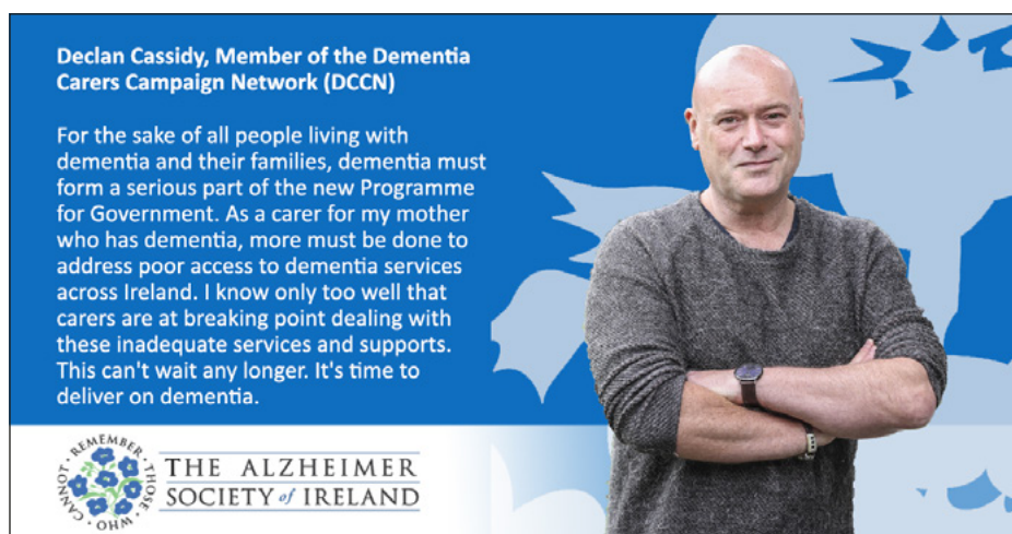
An example of the carers stories shared as part of the election campaign

COVID-19 has been a perfect storm for people with dementia. With the closure of our day centres, social clubs, Alzheimer cafés and face-to-face carer training, the people we support have been hit very hard. They have nowhere to go each day to keep them active and stimulated. This means that thousands of people with dementia and their carers cannot access crucial services at this time. Everyone's lives have been turned upside down during this health crisis – but people with dementia are particularly vulnerable here.