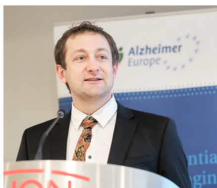
Christophe Hansen, MEP moderated the lunch debate on Innovative Medicines Initiative funded projects on dementia